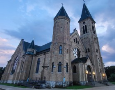
St. Andrew the Apostle W3081 County Rd. Y, Lomira Mass: Tues. & Thur. 8:00am / Sun. 7:45am