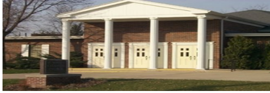
St. Mary of Good Counsel 302 S. German St., Mayville Mass: Fri. 8:00am / Sat. 4:30pm / Sun. 10:30am