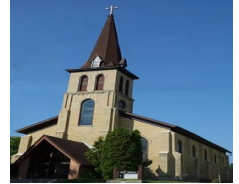
St. Theresa 102 Church St., Theresa Mass: Wed. 8:00am / Sun. 9:15am