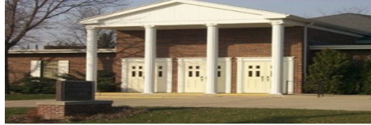
St. Mary of Good Counsel 302 S. German St., Mayville Mass: Fri. 8:00am / Sat. 4:30pm / Sun. 10:30am