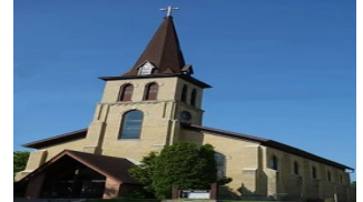
St. Theresa 102 Church St., Theresa Mass: Wed. 8:00am / Sun. 9:15am