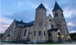
St. Andrew the Apostle W3081 County Rd. Y, Lomira Mass: Tues. & Thur. 8:00am / Sun. 7:45am