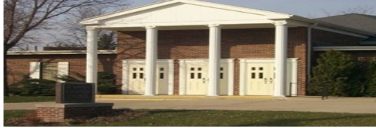
St. Mary of Good Counsel 302 S. German St., Mayville Mass: Fri. 8:00am / Sat. 4:30pm / Sun. 10:30am