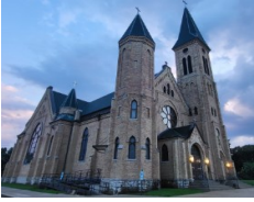
St. Andrew the Apostle W3081 County Rd. Y, Lomira Mass: Tues. & Thur. 8:00am / Sun. 7:45am