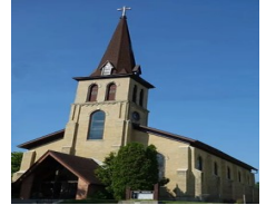
St. Theresa 102 Church St., Theresa Mass: Wed. 8:00am / Sun. 9:15am