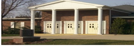
St. Mary of Good Counsel 302 S. German St., Mayville Mass: Fri. 8:00am / Sat. 4:30pm / Sun. 10:30am