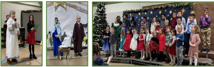
St. Mary School 3K – 3 rd Grade Christmas Program December 19, 2023