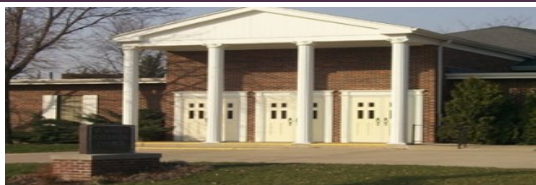
St. Mary of Good Counsel 302 S. German St., Mayville Mass: Fri. 8:00am / Sat. 4:30pm / Sun. 10:30am