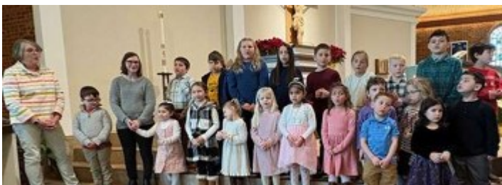
Catholic Schools Week Kick Off!