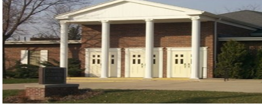
St. Mary of Good Counsel 302 S. German St., Mayville Mass: Fri. 8:00am / Sat. 4:30pm / Sun. 10:30am