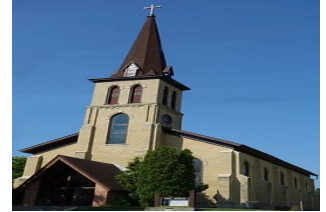
St. Theresa of Jesus 102 Church St., Theresa Mass: Wed. 8:00am / Sun. 9:15am