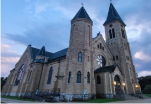
St. Andrew the Apostle W3081 County Rd. Y, Lomira Mass: Tues. & Thur. 8:00am / Sun. 7:45am